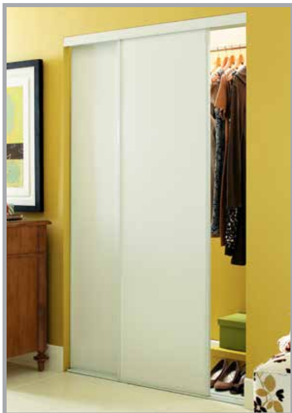
Pictured in a Gloss White finish with White hardboard