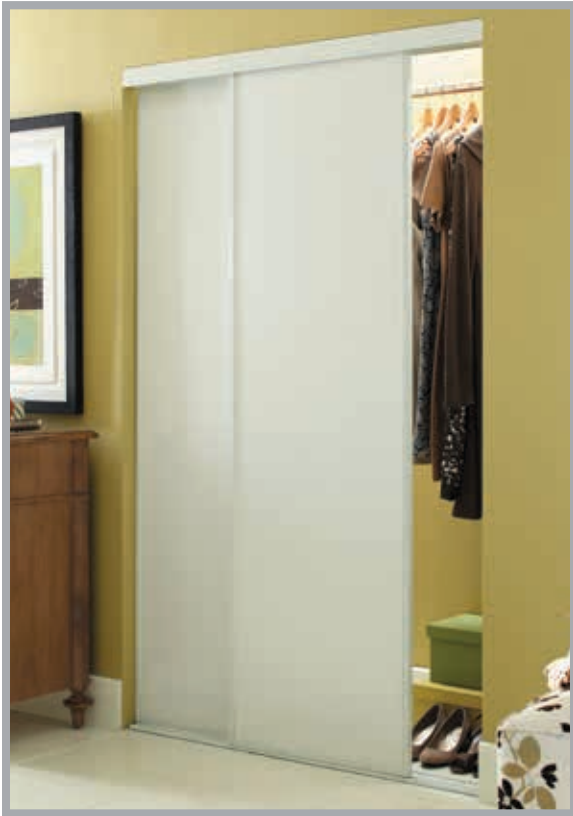
Photo shows a Gloss White finish with white hardboard insert