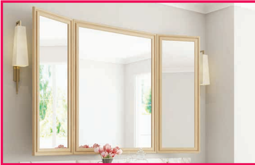
Photo shows a Whitewash Stain finish with Duraflect® copper-free mirror insert