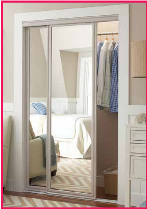
Pictured in a Whitewash Stain finish with Duraflect® copper-free mirror