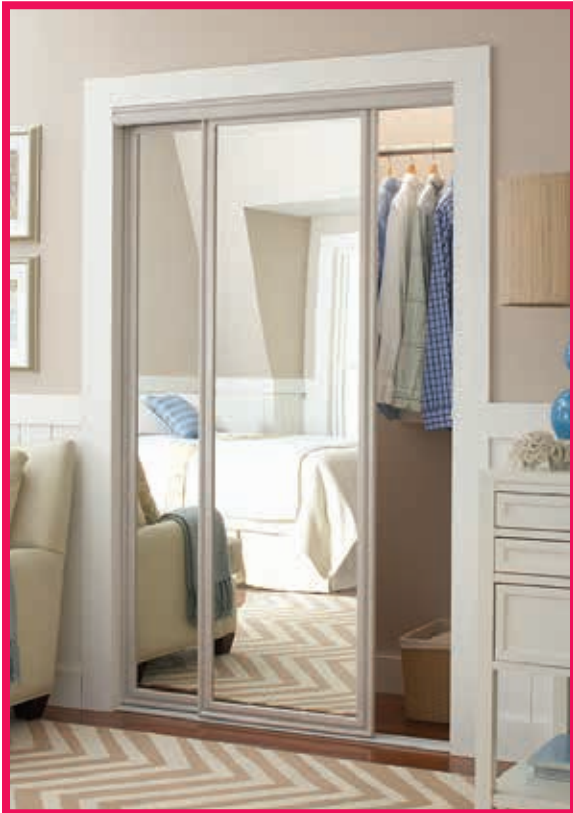
Photo shows a Whitewash Stain finish with Duralect® copper-free mirror insert